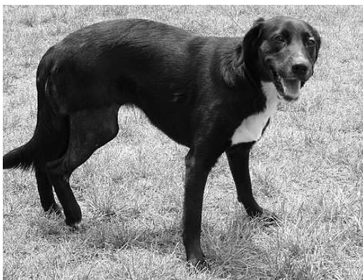
Princess, recuperating at the shelter

Princess just got out of the Vet's office and is in the care of our staff at the shelter. Only time will tell if the leg can heal properly; if not, it will have to be removed.