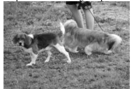
Tucker with new best friend

Gus (renamed Tucker) : The gorgeous Beagle that was spotted on PetFinder by his new owner and is living the good life with a young couple and another dog companion.