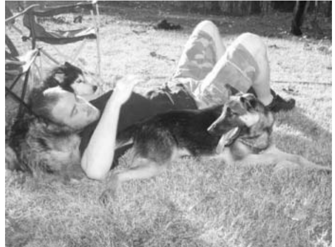
Pepper the Huskie , with Belle the Shepherd Pepper was featured in our Spring 2007 newsletter as our adoption of the year.