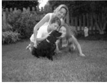
Licorice with her new family

Before each dog is adopted they are immunized, heartworm-tested (and treated if necessary), spayed or neutered, and most of them visit adoption sites. All of this is made possible by you, our wonderful supporters, our staff, and a host of volunteers. Thank you for your support, without which all of these dogs would have faced a bleak future.