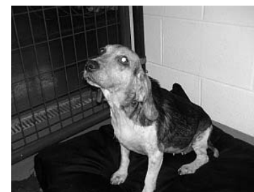
Sadie, with "peach fuzz" for fur after 1 month of treatment

Sadie (left, with her new owner) arrived at the shelter emaciated and with a severe case of mange which was easily treated with food, love, and basic mange treatment. Now she has the home she deserves, and is treated like a princess. Her new owner even hosted a coming home party in her honor!