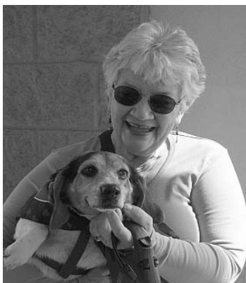
Sadie Hawkins stopped by to say Hi and Thank You

In any case, I am so grateful that I decided to adopt her. She is so loving and has a wonderful personality. Its been a great experience. I highly recommend adopting an older kitty because they need homes as much as kittens do but are harder to place just because of their age and that is a shame.