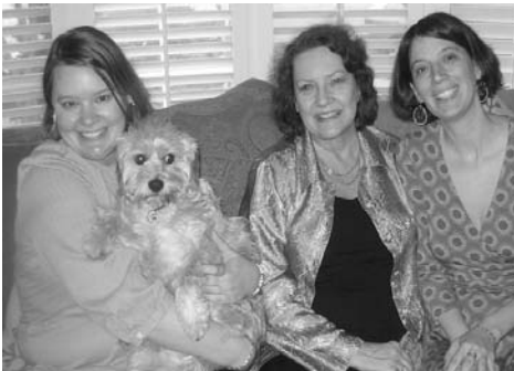
Izzie, now Paisley, with her new family in Northern VA