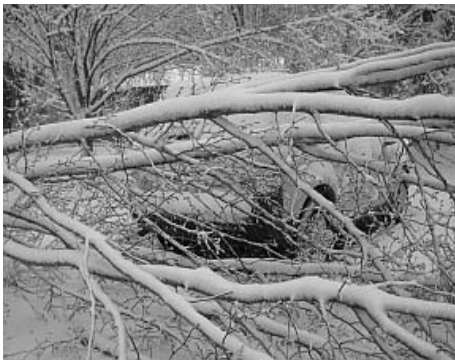
Downed trees and power lines crippled the Farmville area March 2-5th

Director Sandy Wyatt headed in Monday at 7 am, waiting for sunlight due to the snow. 5 miles from the shelter downed trees made the roads impassable, so she abandoned her vehicle and walked 3 miles before being picked up by a good Samaritan who dropped her off at the shelter.