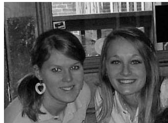
The smiling wait staff at Charley's Worked hard to earn donations for Southside SPCA.