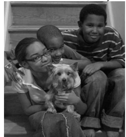
Cricket and his new family

Hi, I wanted to send you a picture of Cricket in his new home. He's doing very well and we all love him. He has *very* few potty accidents and loves to be wherever we are in the house.